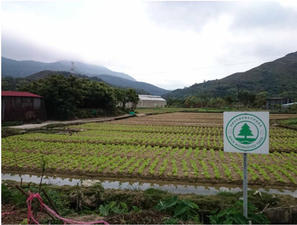
Figure 1 and 2 Agricultural land, both active and abandoned, would be affected by the proposed development