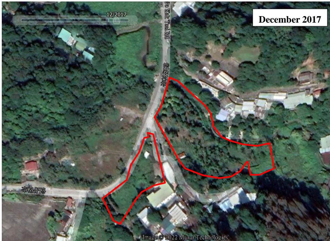
Figure 1-4 According to the aerial photos from Google Earth, the application site (marked in red) has been subject to land formation and vegetation clearance